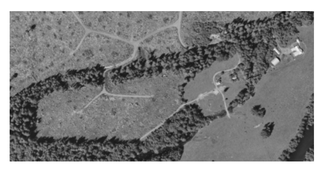
(Exhibit 31) (7/19/1994)

In 1981, Gerry Keck, an employee of Rayonier, surveyed Rayonier's property, including the Disputed Property. (Exhibit 17, 18) In addition to creating a survey, Gerry Keck also blazed the property line, which involved physically walking the property line and marking the property line through "blaze" marks on the trees. (Exhibit 17) In the