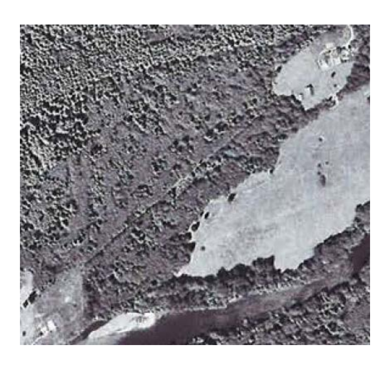
(Exhibit 23) (7/16/1971)

Aerial photographs support the existence of the Road in the disputed area since the 1970s: